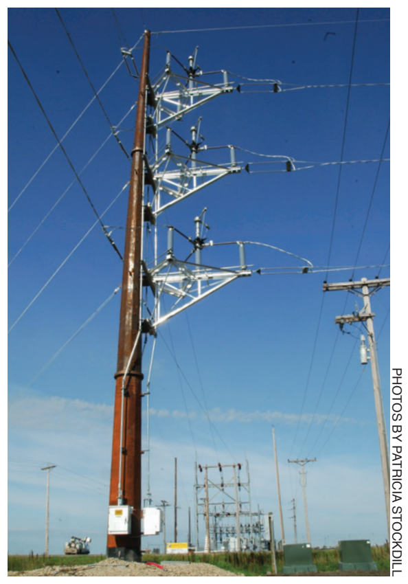
The construction of this transmission line going to northwestern North Dakota enabled McLean Electric Cooperative, Central Power Electric Cooperative and Basin Electric Power Cooperative to make plans to upgrade a transmission line in the Washburn area in 2018.