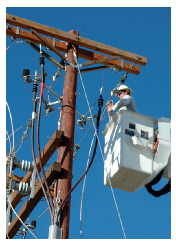
Part of McLean Electric Cooperative's work plan involves Central Power Electric Cooperative's upgrade to a transmission line between Max and Benedict, along with three-phase upgrades on McLean Electric's line. Power line upgrades on the transmission and distribution end alike help McLean Electric Cooperative continually strive to improve service and reliability.

Upgrades to Central Power's transmission line from the Washburn substation to the Blue Flint Ethanol plant, which also carries the electric load for Great River Energy's pumps and used to pump cooling water for Coal Creek Power Plant. The project is in conjunction with McLean Electric's main wholesale generation and transmission provider, Basin Electric Power Cooperative (BEPC).